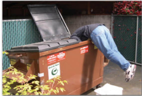
Dumpster Diving is legal.